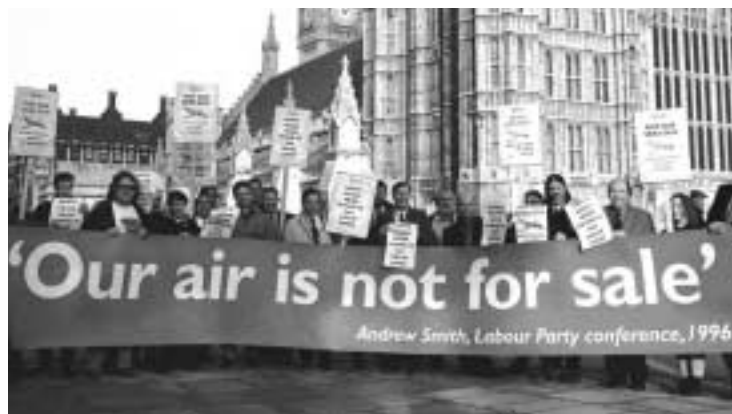
Air Traffic Control is just one of New Labour's targets for privatisation

Initiative and Public Private Partnership schemes in education.