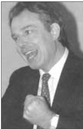
Thatcherite line – Blair

The Socialist Alliance opposes any further erosion or privatisation of the welfare state.