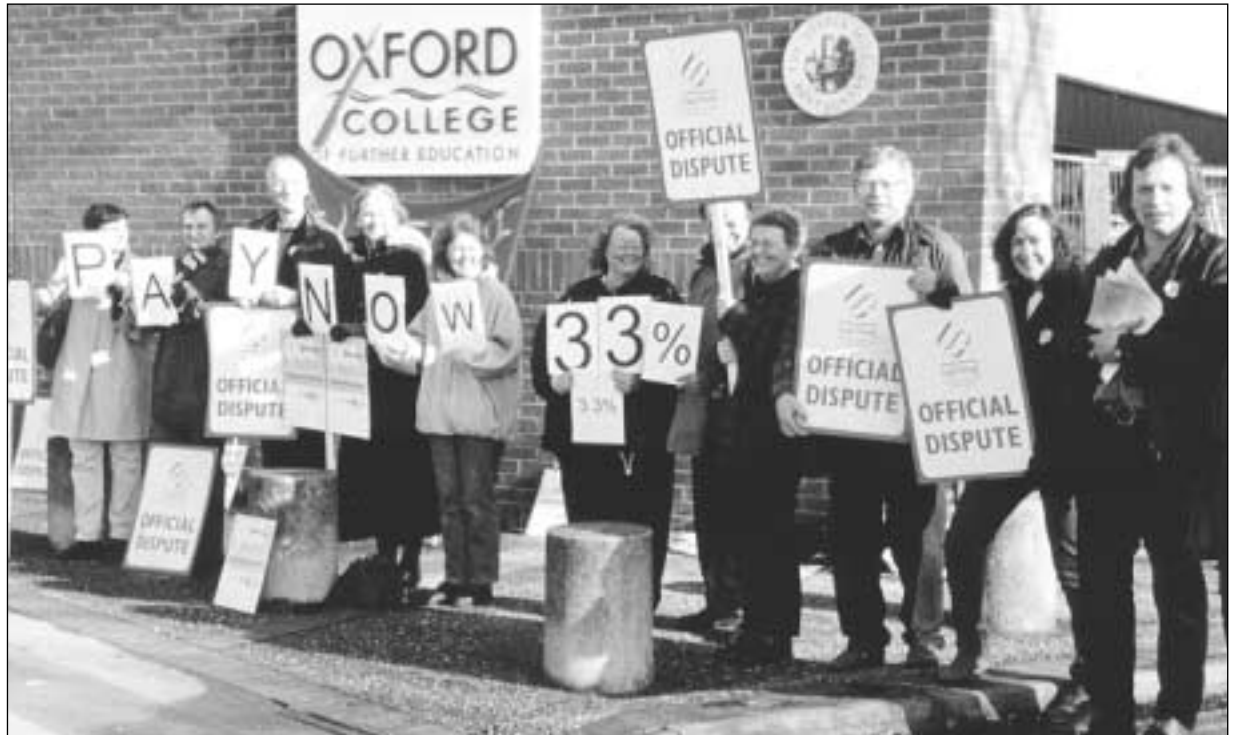
Lecturers from Oxford College of Further Education staged a one-day strike on April 3 in protest at the College's refusal to offer a pay increase last year. The Socialist Alliance argues that FE Colleges, which were hived off by the Tories must be brought back under democratic control, and given the resources to recruit and retain staff.

ucts should be locally grown as much as possible; we must replace intensive capitalist exploitation of land and animals with sustainable farming.