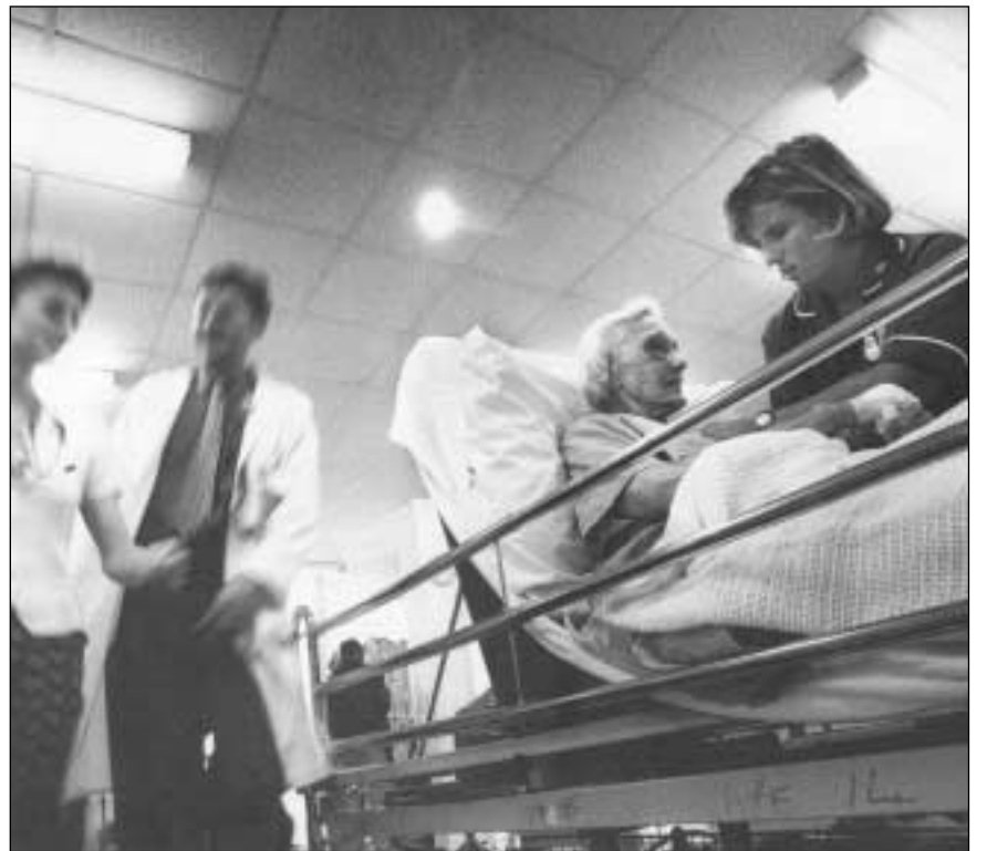
PFI will drain cash from front-line NHS hospital and community services

companies such as BUPA. The Socialist Alliance has policies for a first-rate health service free to all: