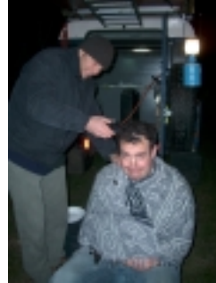
The Slippy Salon