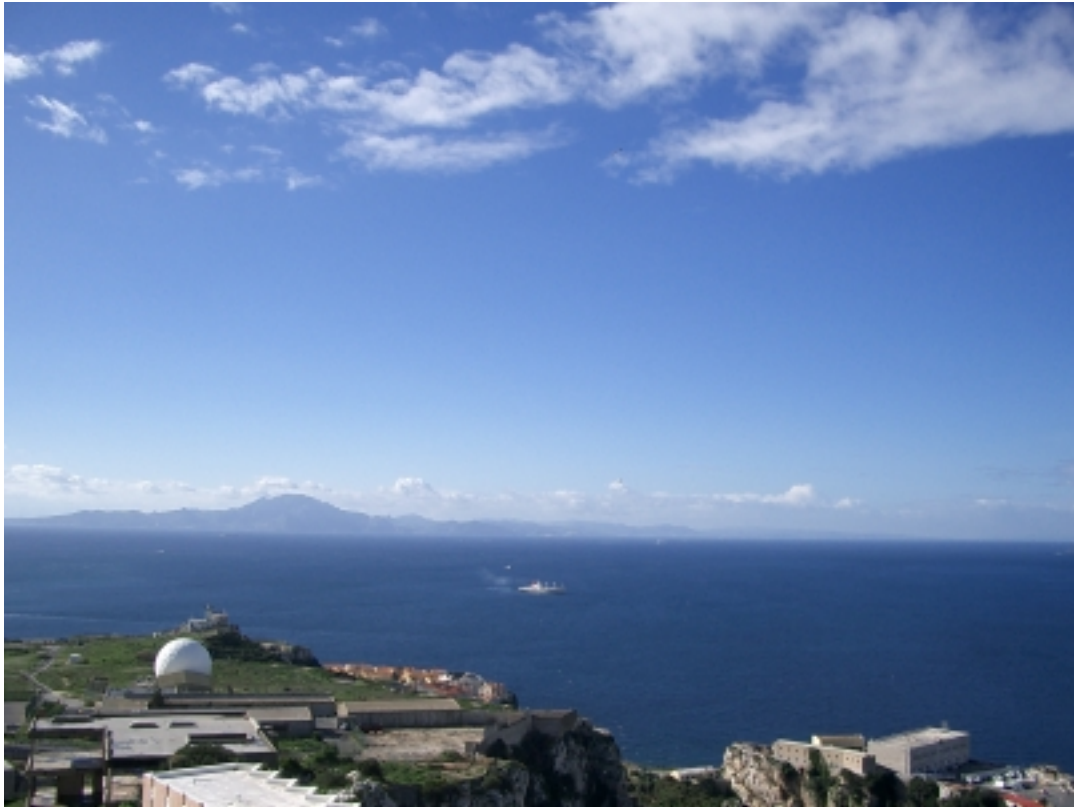
The Straits of Gibraltar