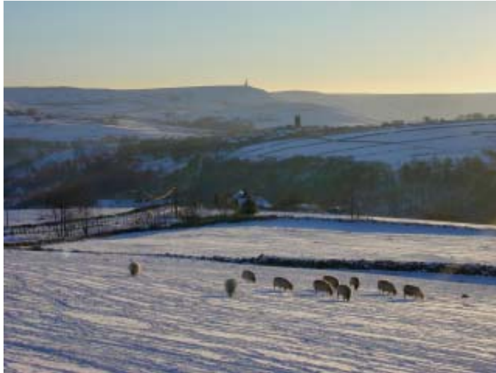
Heptonstall and Stoodley Pike coming from Howarth