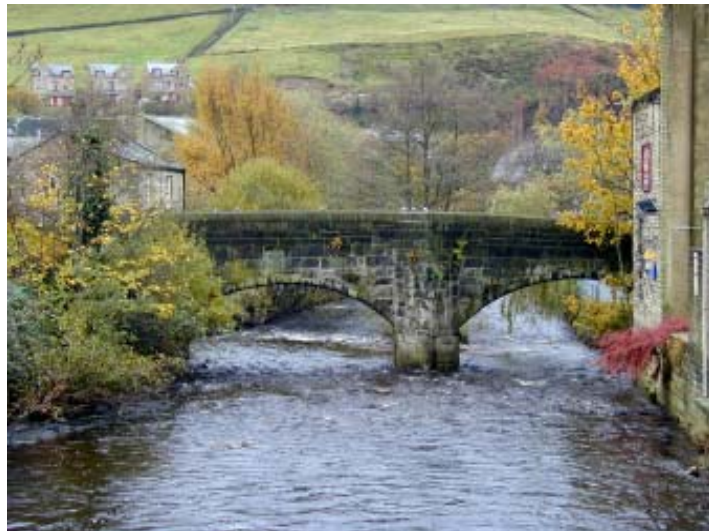
Packhorse Bridge at nearby Hebden Bridge